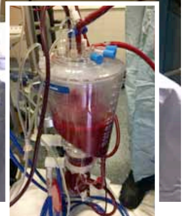
Main image: A kidney undergoing EVNP in the operating theatre. The surgeon keeps a careful eye on the kidney while the machine pumps it with warm oxygenated blood. The kidney itself is not visible, but lies in the metallic box in the centre of the photograph